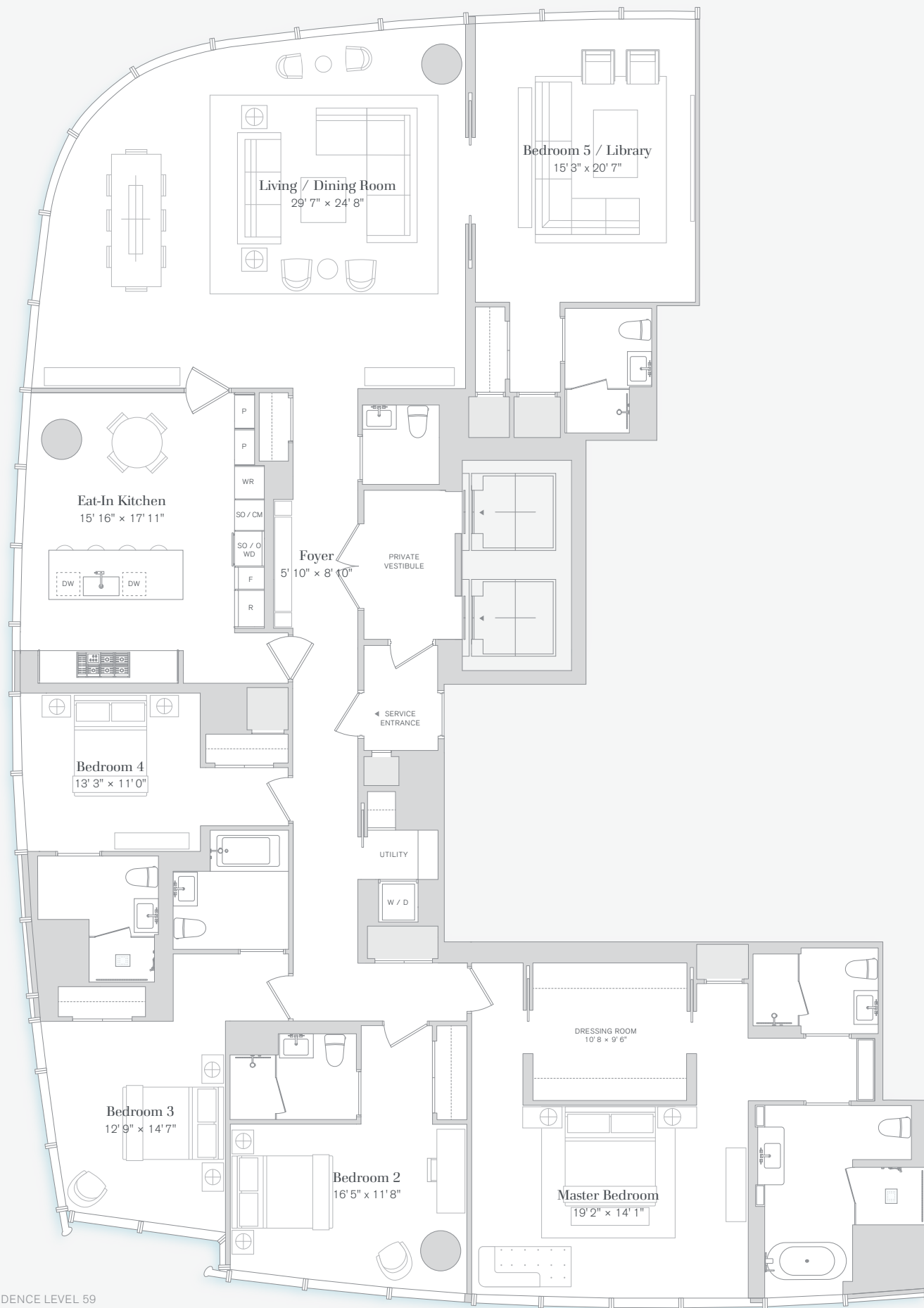
RESIDENCE LEVEL 59