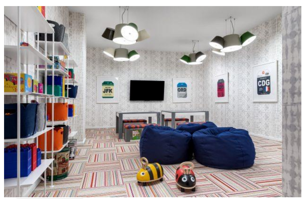
11 Beach Street