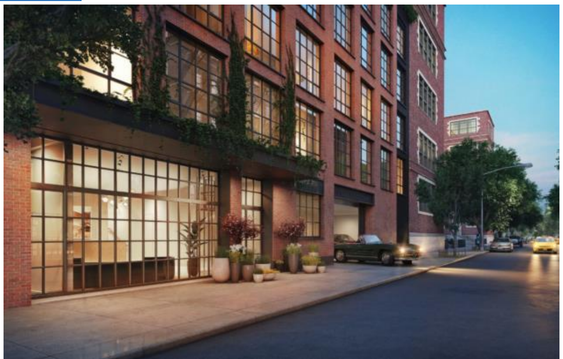
Steiner East Village

Downtown Manhattan is the perfect place to move for the whole family to enjoy the views and the great location near so many cultural attractions, parks, schools, and more. We've created a <u>selective guide</u> to some of the most beautiful and family-friendly homes throughout the <u>hottest neighborhoods</u> for family's in lower Manhattan that you'll absolutely fall in love with!