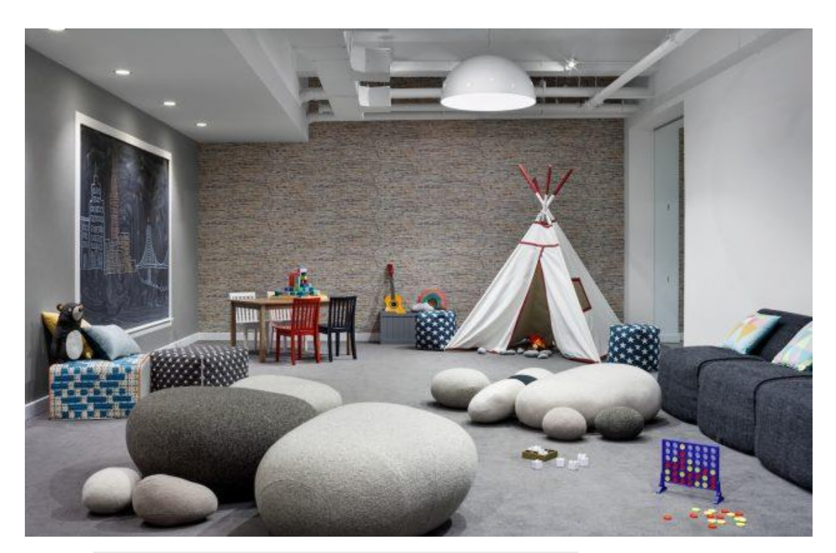
88 & 90 Lexington Avenue